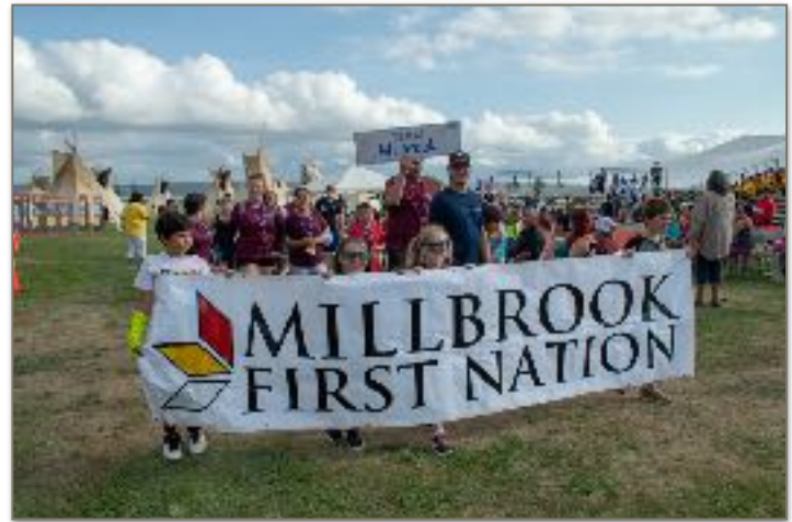
Millbrook Athletes at The Nova Scotia Mi'kmaw Summer Games

The Honourable Carolyn Bennett Minister of Crown-Indigenous Relations stopped in at the Millbrook Band Office for a chat.