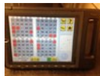
ELECTRONIC HANDHELD $100.00 (WITH ENTRANCE PKG PURCHASE)