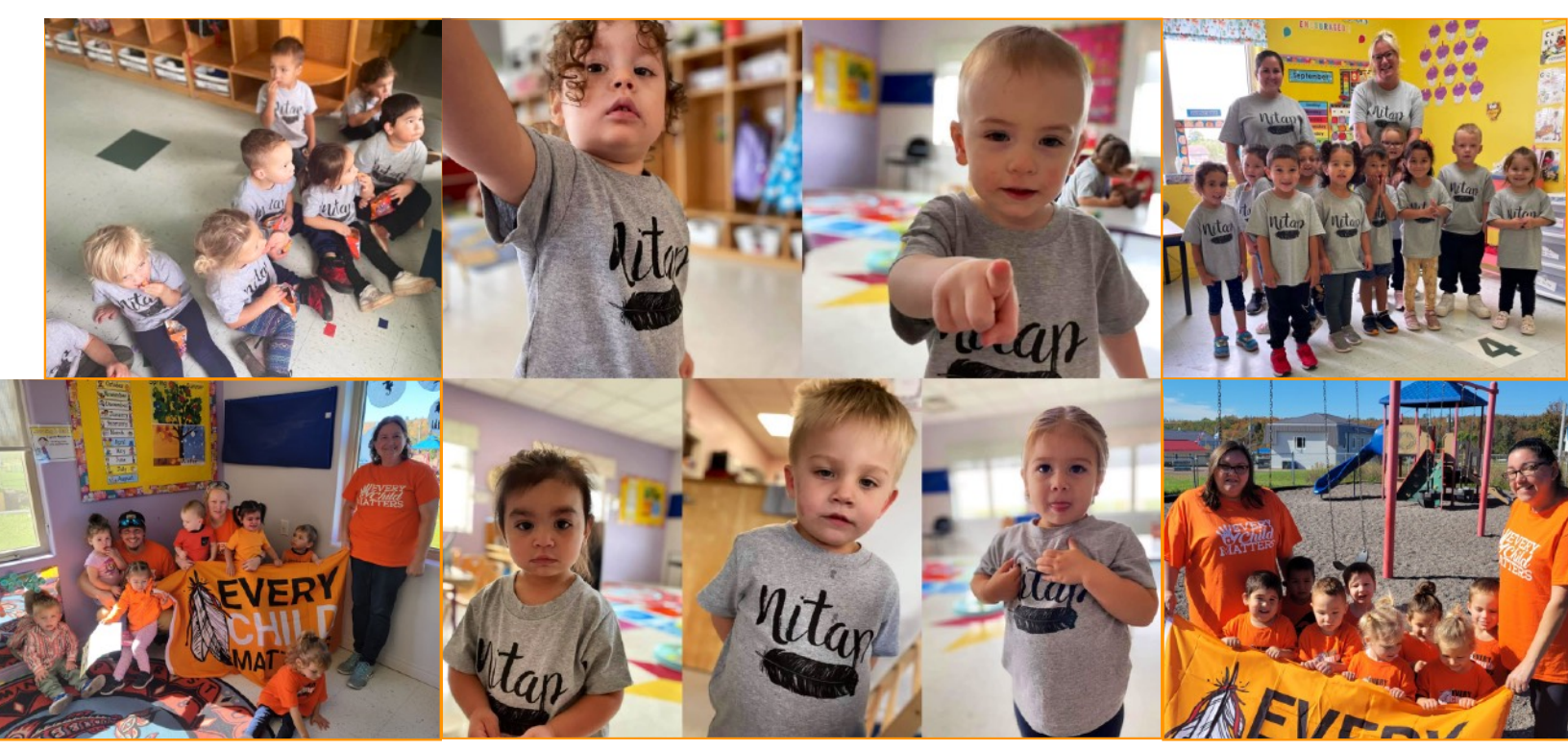
Truth and Reconciliation Walk