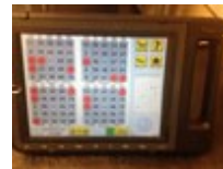
ELECTRONIC HANDHELD $100.00 (WITH ENTRANCE PKG PURCHASE)